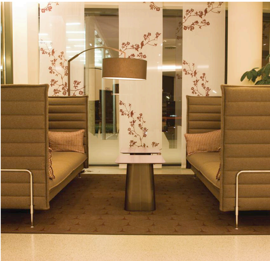
Steel-framed Hirche chairs with cowhide upholstery sit with raspberry-hued timber tables on cowhides rugs in front of the fireplace, above. High-sided sofas from Vitra offer an intimate setting in the lobby, while fabric windows screens offer a further element of privacy

Leather club chairs are also offered for more private chats, while plush rugs on smoked oak flooring add to the warm and friendly ambience, and sheers at the windows soften the bar's 'masculine' style.