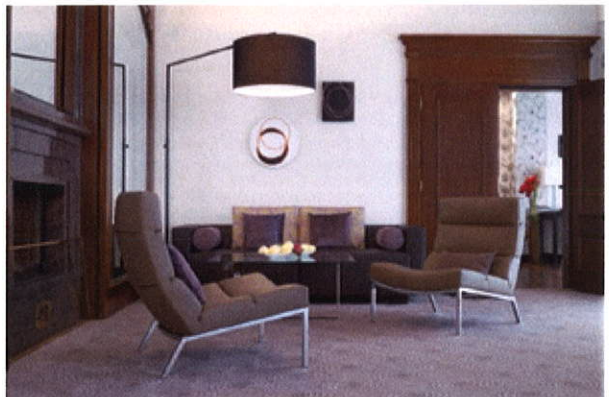
Diplomatic Suite Living Room