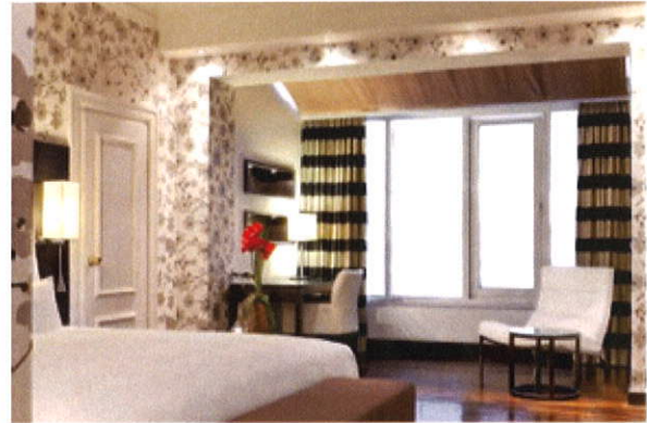
Diplomatic Suite Secondary Bedroom

URL : http://www.etravelblackboardasia.com/article/78073/modern-and-majestic-joi-design-bestows-stately-sophistication-upon-le-mridien-stuttgart