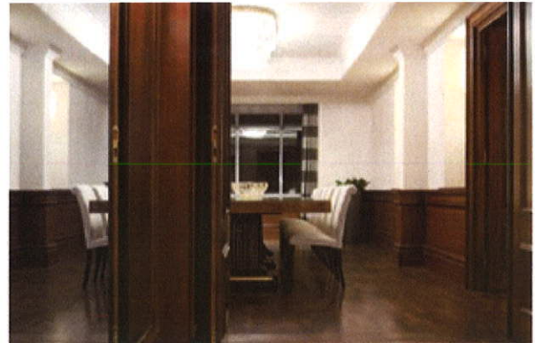
Presidential Suite Conference Room