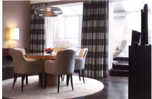
Presidential Suite Winter Garden Room

Le Méridien Stuttgart also enjoys the largest suite in the city, the 250 m2 Presidential Suite which has been re-imagined by JOI-Design to have a timeless elegance with a sophisticated grey and gold colour palette. Grand mirrors with richly polished timber frames draw the light and lush vistas viewed through the windows into the living room, the heart of the spaces. The original, working fireplace creates a natural gathering space, providing a warm and cosy comfort that makes guests feel right at home. Adjacent to the living room is an intimate, round dining table hewn from honey-tinged hardwoods and an elevated winter garden, a solarium fitted with plush ivory upholstered loungers that offer an ideal spot for relaxation in the sunlight - especially cherished during the cooler months.