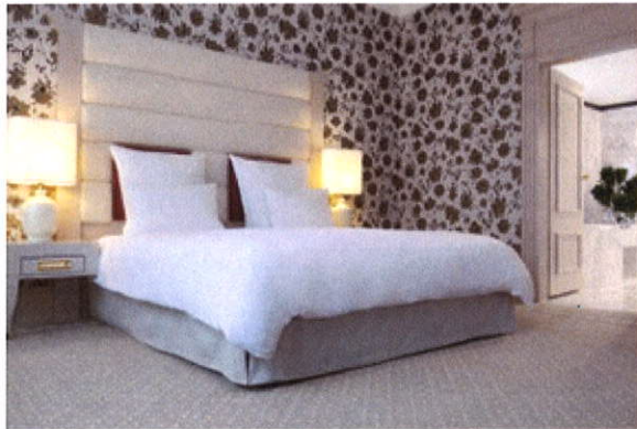
Diplomatic Suite Master Bedroom